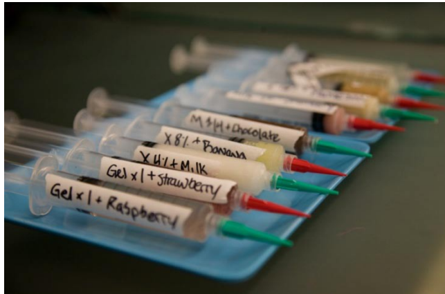
Figure 1 Various hydrocolloid formulations loaded into 10 mL Luer-Lok syringes

Xanthan gum and gelatin were prepared in water at various concentrations, ranging from 0.5% gelatin in water (by weight) to 4% gelatin in water, and from 2% xanthan in water to 16% xanthan in water. After preparation, the hydrocolloid concoctions were loaded into 10 mL syringes.